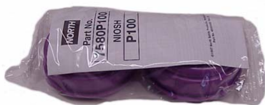
Factory Sealed Cartridges

Use only new cartridges and filters for changing out replacements. All new cartridges and filters come in factory sealed bags. Do not change out with unsealed cartridges and filters.