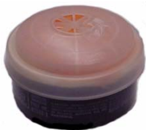
Proper cartridge/filter combination