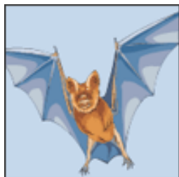
Drawings Courtesy of CDC

Clover Safe notes are intended primarily for 4-H volunteers and members nine years and older.